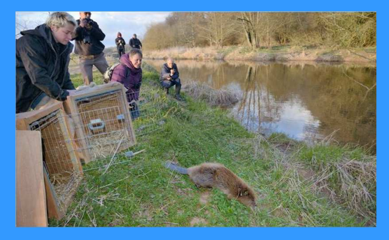
Beaver reintroduction on the R. Otter in Devon