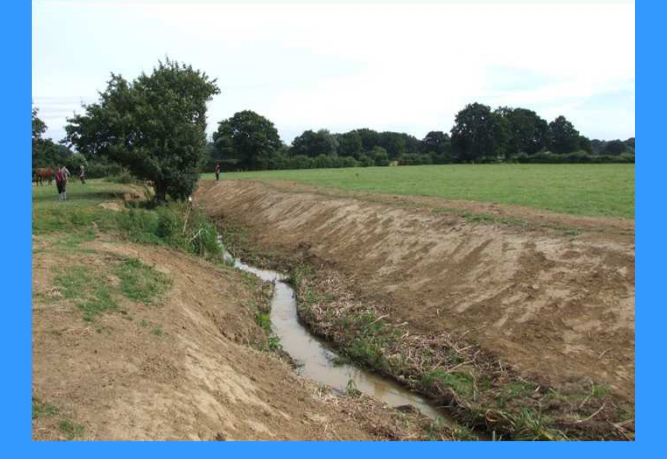
Hammer Stream, Kent