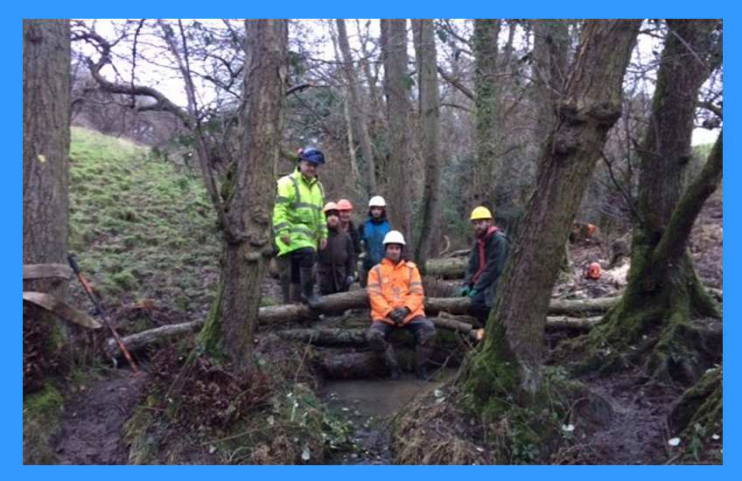
Hebden Bridge volunteers learning from Stroud

Evidence from Belford Burn, Northumberland: Installation of 6 large woody debris structures in a headstream near Belford, more than doubled the travel time for the peak of the flood 1 km downstream