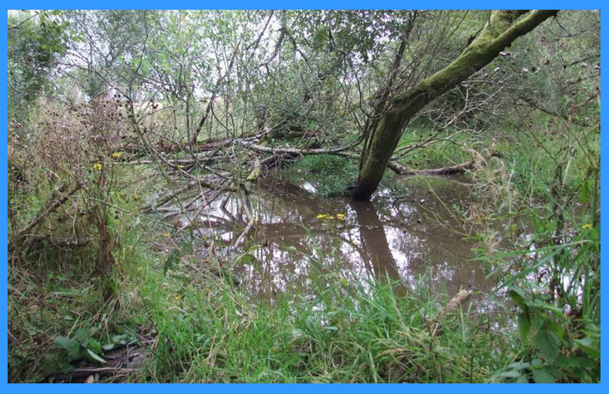
Beaver pond at Boldventure

Evidence from Boldventure beaver enclosure, Devon: In 5 years, the beaver family have constructed 13 dams holding up to 1M litres of water in ponds on the site, reducing peak flows by 30% and increasing lag times by 1 hr app. 200 metres downstream