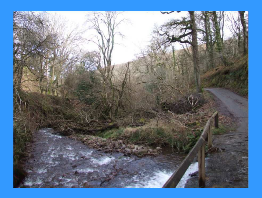
Leaving woody debris in situ at Holnicote