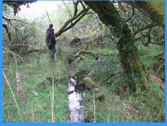
Beaver canal at Boldventure