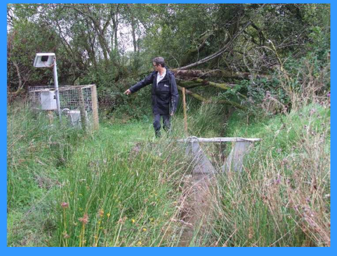
Monitoring equipment at Boldventure