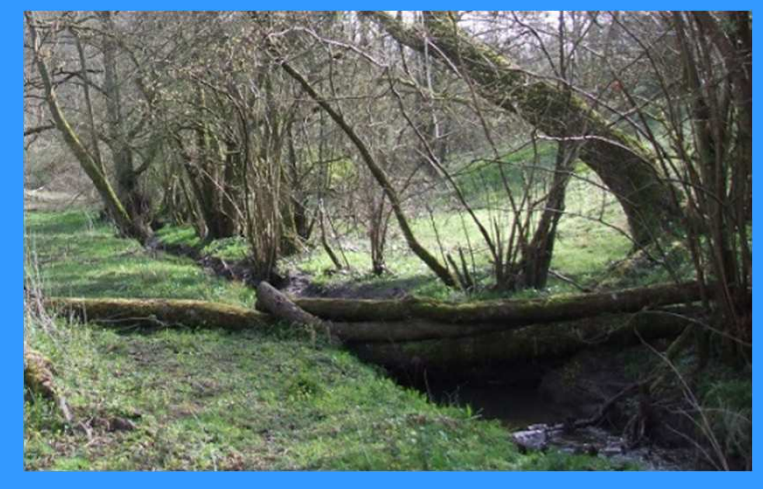
High flow woody debris dam, Slad Valley, Glos